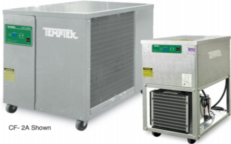
CF- 2A Shown